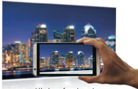
High refresh rate

High brightness: 6000nits ; High gray scale: 65536 levels ; High refresh rate: 2000Hz; High contrast ratio.